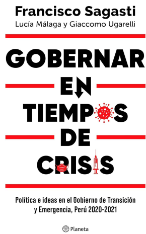
GOBERNAR EN TIEMPOS DE CRISIS