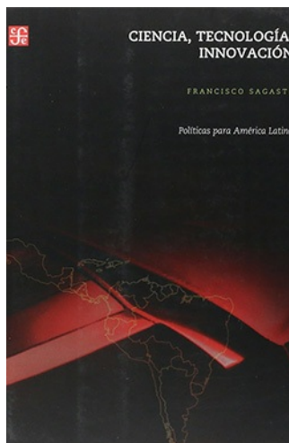
CIENCIA, TECNOLOGÍA, INNOVACIÓN