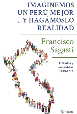
IMAGINEMOS UN PERÚ MEJOR ... Y HAGÁMOSLO REALIDAD