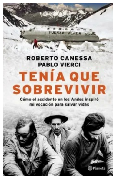
I HAD TO SURVIVE