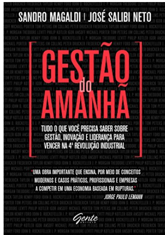
GESTÃO DO AMANHÃ