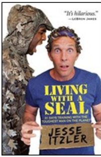
LIVING WITH A SEAL