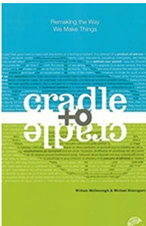
CRADLE TO CRADLE