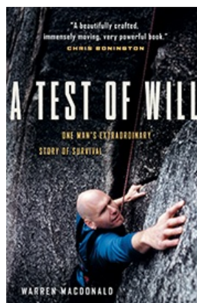
A TEST OF WILL