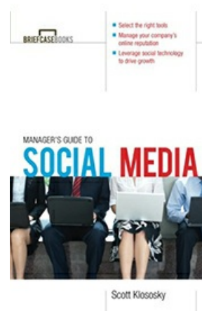
MANAGER'S GUIDE TO SOCIAL MEDIA