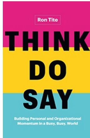
THINK DO SAY