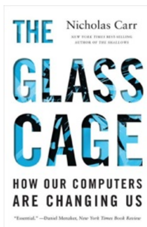
THE GLASS CAGE