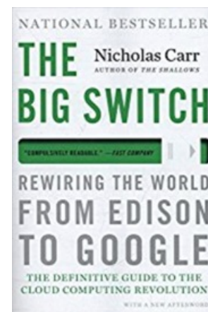
THE BIG SWITCH