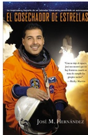
EL COSECHADOR DE ESTRELLAS