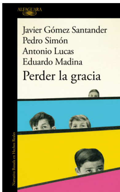
PERDER LA GRACIA