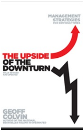
THE UPSIDE OF THE DONWTURN