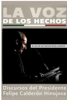
LA VOZ DE LOS HECHOS