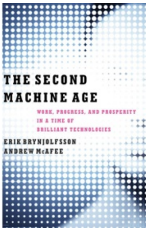
THE SECOND MACHINE AGE