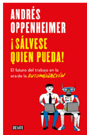
SÁLVESE QUIEN PUEDA