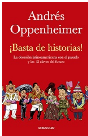
BASTA DE HISTORIAS