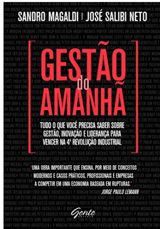
GESTÃO DO AMANHÃ