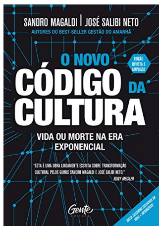
O NOVO CÓDIGO DA CULTURA