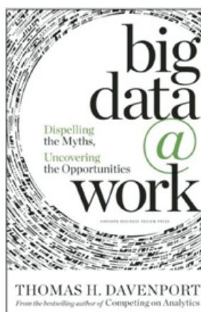
BIG DATA A WORK