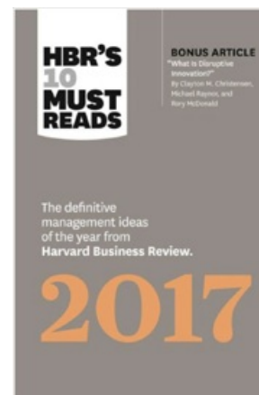
THE DEFINITIVE MANAGEMENT IDEAS OF THE YEAR FROM