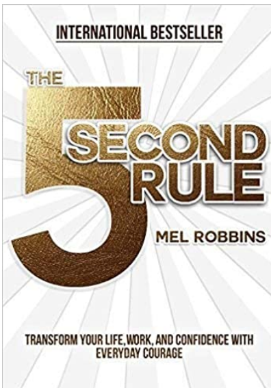
THE 5 SECOND RULE