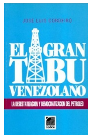
EL GRAN TABU VENEZOLANO: LA DESESTATIZACION Y DEMOCRATIZACION DEL PETROLEO