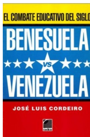
BENESUELA VS. VENEZUELA: EL COMBATE EDUCATIVO DEL SIGLO