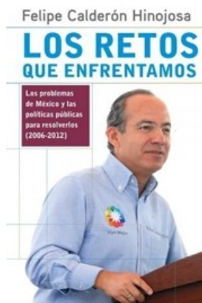
LOS RESTOS QUE ENFRETANTAMOS