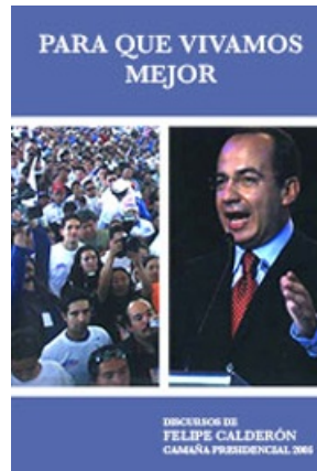
PARA QUE VIVAMOS MEJOR