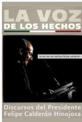
LA VOZ DE LOS HECHOS