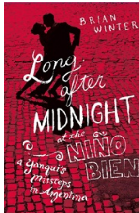
LONG AFTER MIDNIGHT AT THE NINO BIEN