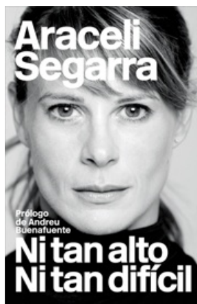
NI TAN ALTO, NI TAN DIFÍCIL