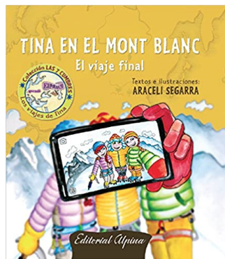
TINA EN EL MONT BLANC